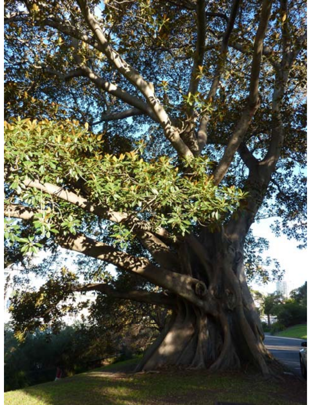
('The Listening tree', Sydney Botanical Gardens)

The sections of this report will discuss support provision for 'missing' families in Australia, share understanding about 'missing' counselling and expand on some themes which may impact people experiencing unresolved loss.