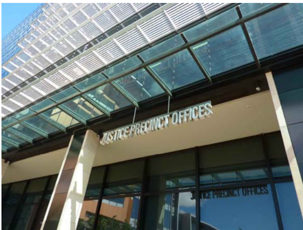
(FFMPU's offices, Parramatta)